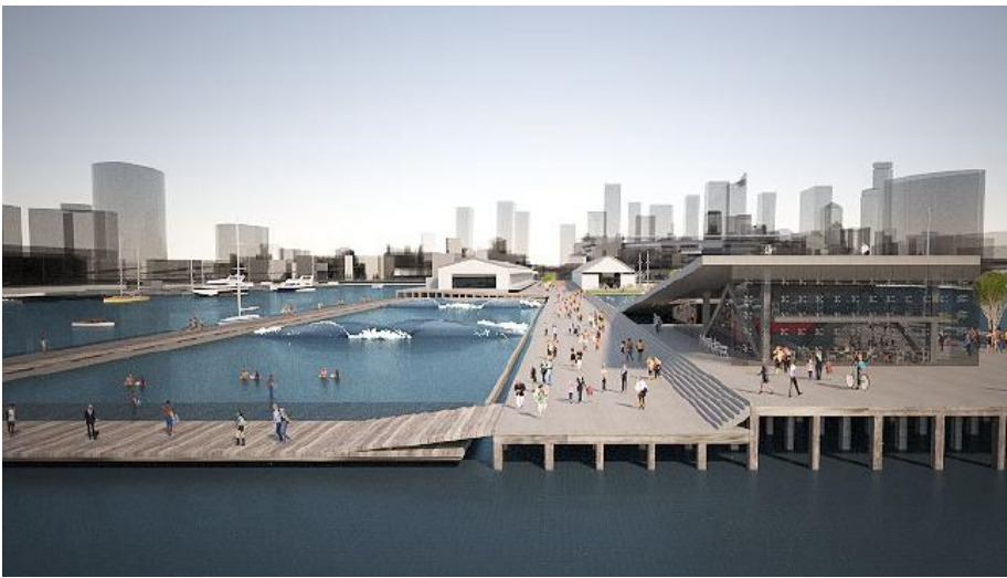
An artist's impressions of the Docklands development.

A $100 million plan to redevelop a neglected Docklands pier with a public pool has been unveiled.