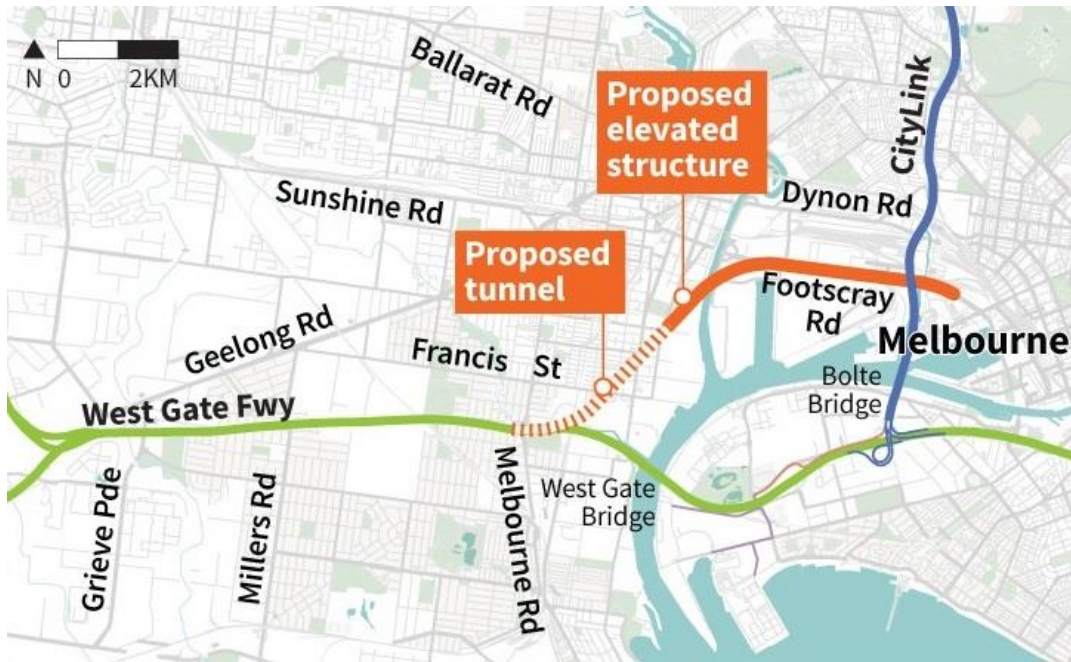
Figure 2 | Western Distributor

The project entails a five kilometre toll road linking the Westgate Freeway at Yarraville with CityLink at Docklands via an underground tunnel and will provide Melbourne with a second river crossing, reduced travel times and take trucks off local roads in the city's inner west.