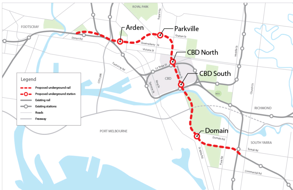
Figure 1 | Melbourne Metro Rail Project