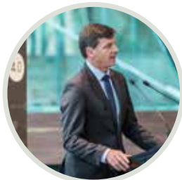
Angus Taylor MP, Assistant Minister for Cities and Digital Transformation