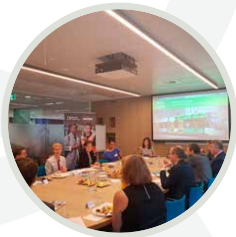
Transport Series 4 at at Tram Hub