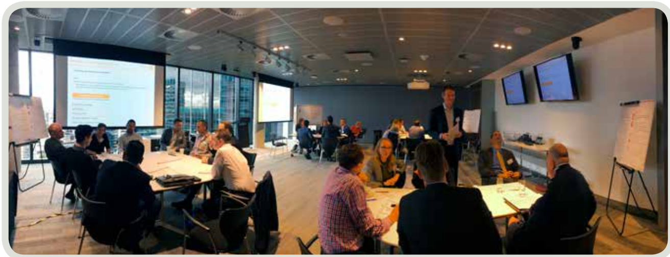
Workshop 3 at PwC Australia