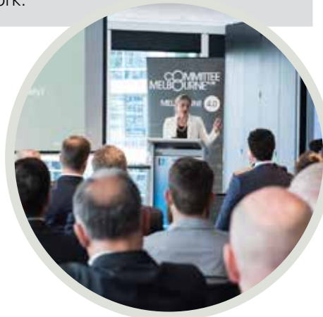
The Hon. Jacinta Allan MP