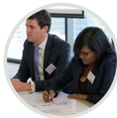
Workshop 2 at Corrs Chambers Westgarth