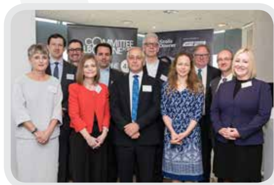
Airport link forum panellists and moderator