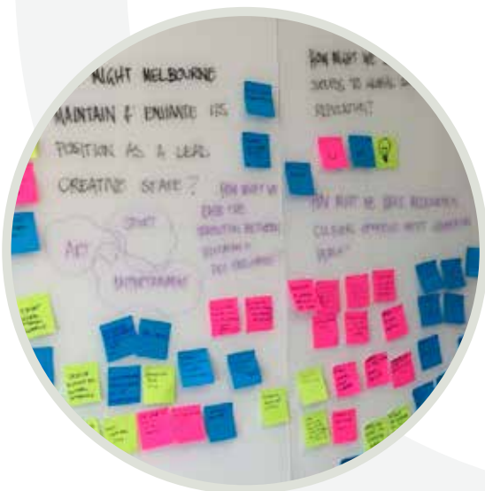
Melbourne's Next Creative Landmark