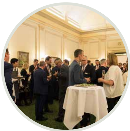
Foundation members connect with each other and MPs from all sides of politics