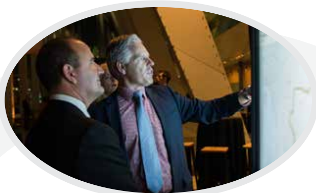
Members experience the PwC Australia interactive data display in the foyer

We thank our 2017 Annual Dinner major sponsors for their contributions.