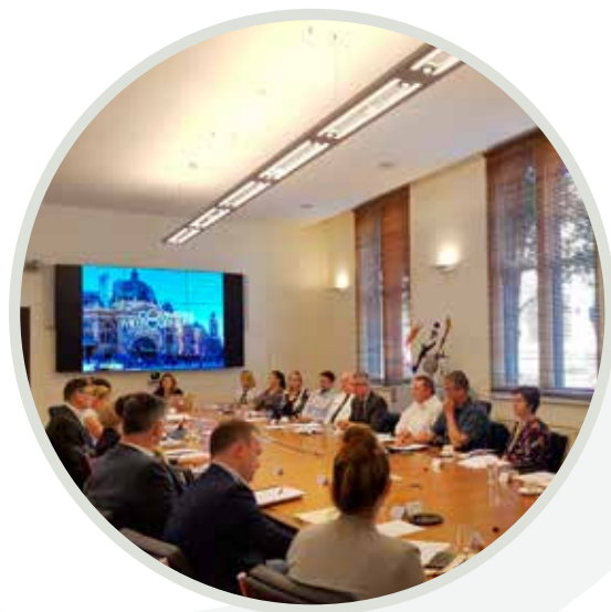
Arts and Culture Roundtable Meeting 1 at RMIT University