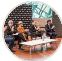
Melbourne 4.0 launch panellists

These geopolitical shifts are introducing uncertainty in the international arena, at a time when governments and voters are struggling to understand and deal with the impact of the fast developments around them.