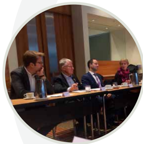
Transport Series 3 at RACV