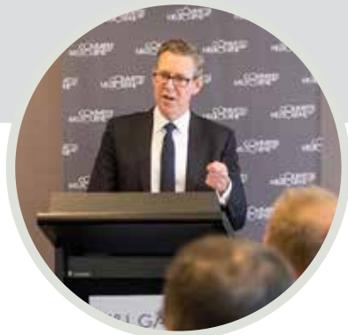
Geoff Culbert, President and CEO, GE Australia, New Zealand and Papua New Guinea