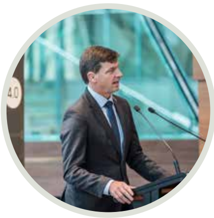
Angus Taylor MP, Assistant Minister for Cities and Digital Transformation