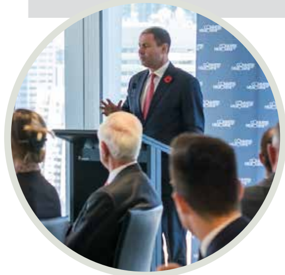
The Hon. Josh Frydenberg MP Minister for the Environment and Energy